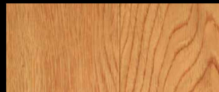
White Oak Natural