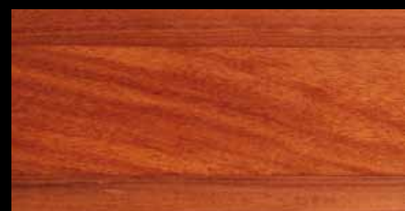
Santos Mahogany, Cabreuva