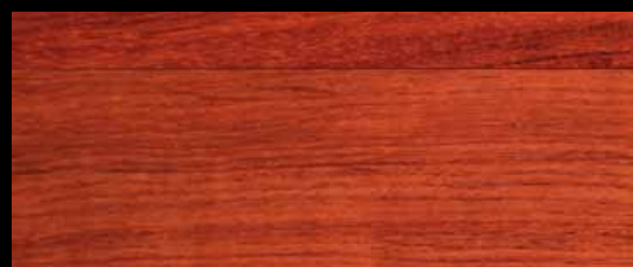
Para Rosewood, Macacauba