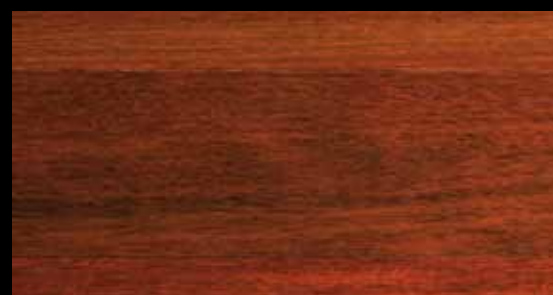
Brazilian Walnut, Ipe