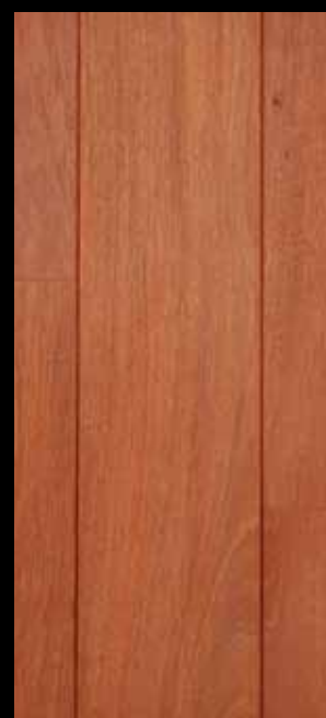
Tiete Rosewood, Sirari