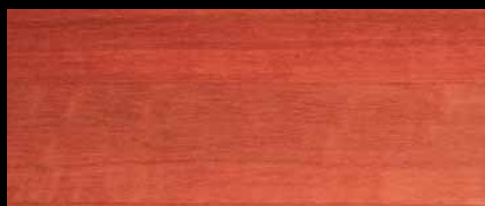
Brazilian Redwood, Massaranduba