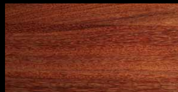
Brazilian Chestnut, Dark Cumarú