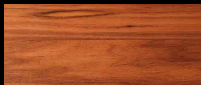
Patagonian Rosewood, Curupau