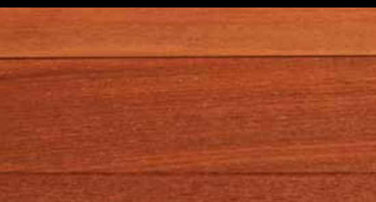
Brazilian Teak, Cumarú