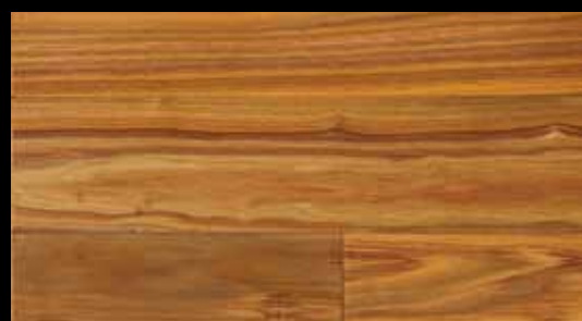
Canary Wood, Tarara