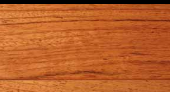
Brazilian Cherry, Jatoba