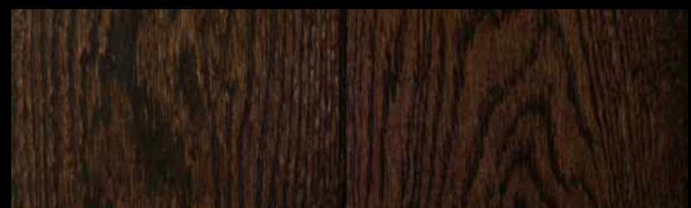
White Oak Coffee