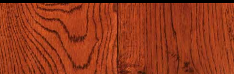
White Oak Asian Teak