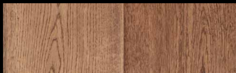
White Oak Tobacco