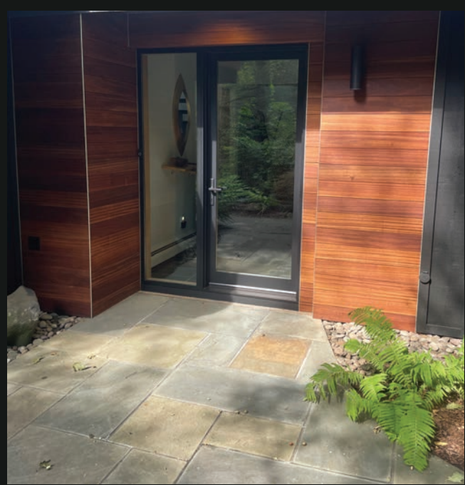
Rainscreen siding finished with ExoShield Natural.