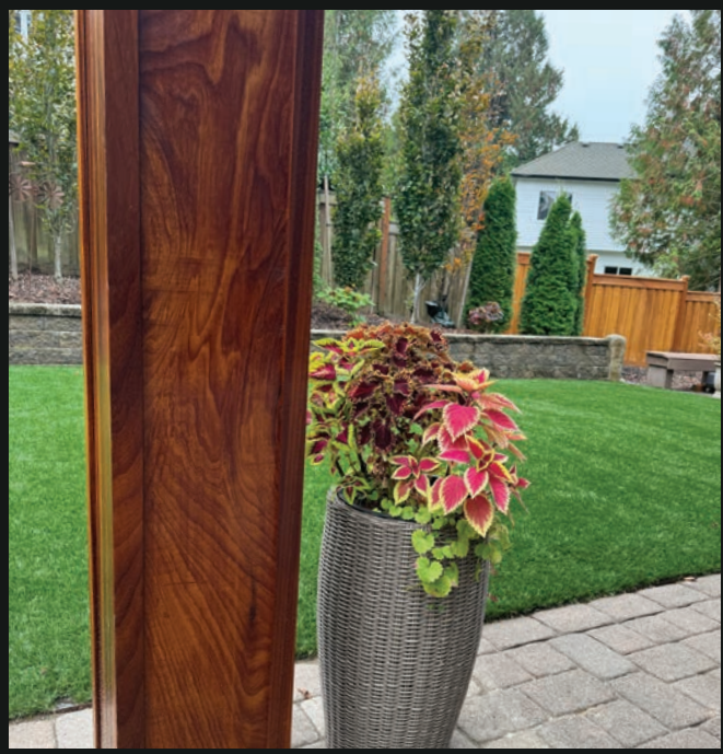
Tongue & groove ceiling and post wraps, finished with ExoShield Clear.